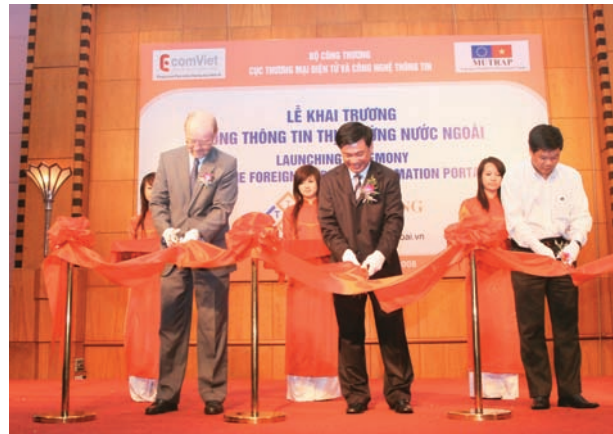
Launching ceremony of the Web Portal on 9 September 2008 in Ha Noi

This is the first and unique Web Portal in Viet Nam that provides systematically with market information from almost of countries, economic-commercial organizations.