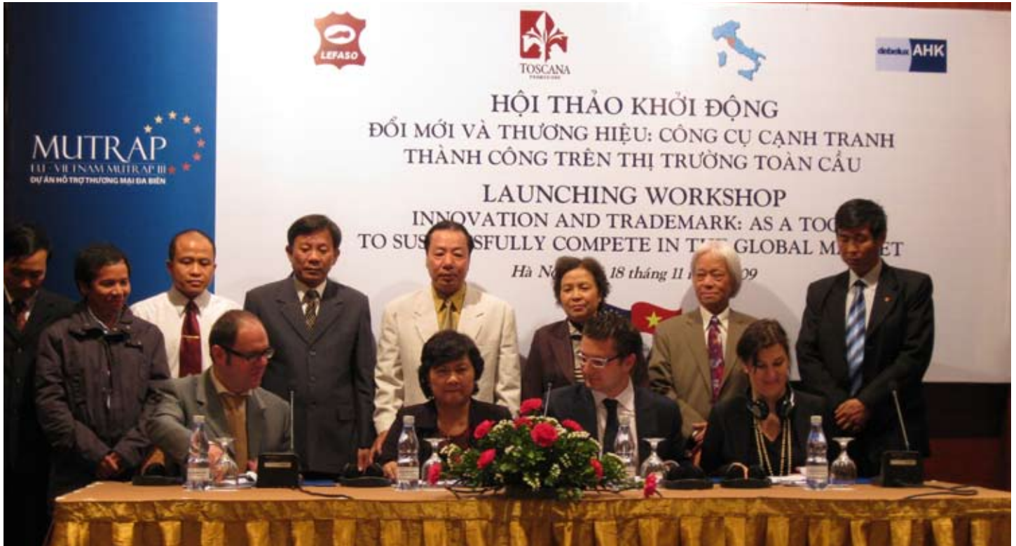
Organisators and representatives of LEFASO in the launching workshop

In the context of increased integration of the Vietnamese economy into the world economy which creates new opportunities, Viet Nam enterprises in general and Leather-Footwear enterprises in particular have to cope with new challenges in the global market. To increase the competitiveness of their products in the export markets, besides the production of high-quality products with low price and the assurance of a prompt delivery, the enterprises should understand the rules and regulations on international trade.